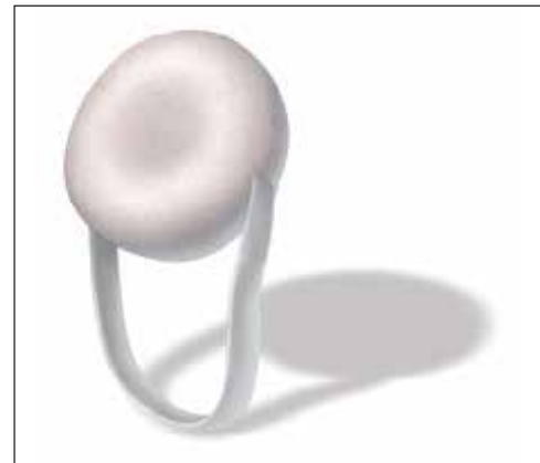
Figure 8. Contraceptive sponge

Produced with permission from FemCap Inc