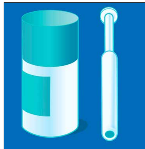
Figure 10. Spermicidal foam