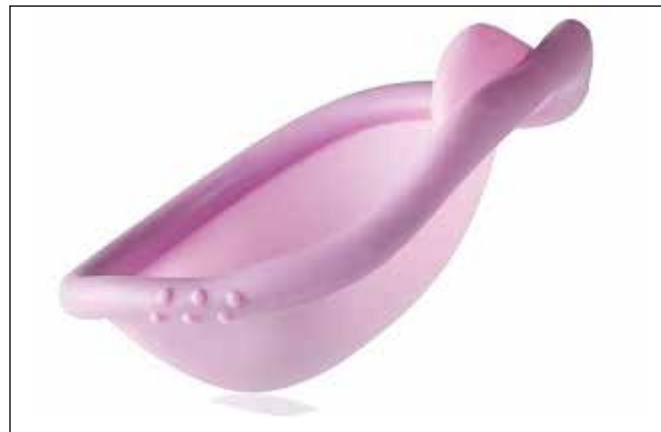
Figure 5. Caya SILCS Diaphragm

Produced with permission from the Trimed Supply Network Ltd.