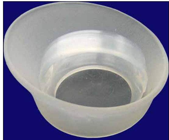
Figure 6. Cervical cap