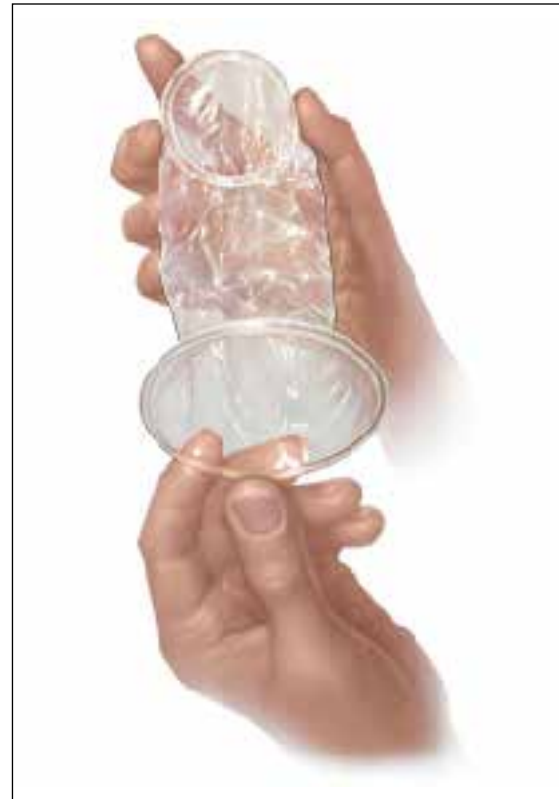
Figure 3. Female condom

inserted between the female condom and the vaginal wall), and invagination (the external retention feature of the condom is partially/fully pushed into the vagina during sexual intercourse). 43