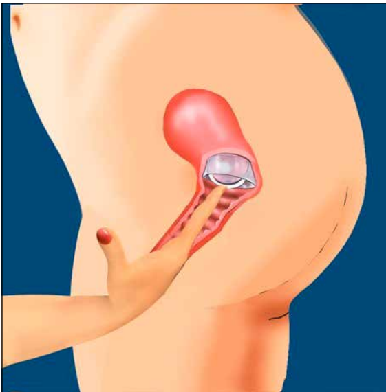
Figure 7. Inserting the cervical cap